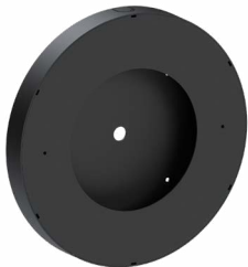
Surface mounting box for easy cabling (SANDY 9) LIGA-SCE-SANDY-9