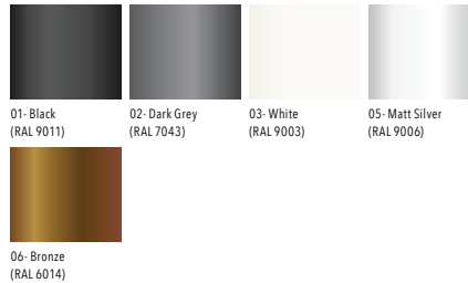
01-Black (RAL 9011) 02-Dark Grey (RAL 7043) 03-White (RAL 9003) 05-Matt Silver (RAL 9006) 06-Bronze (RAL 6014)