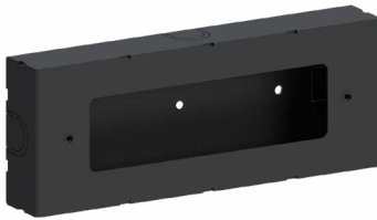
Surface mounting box for easy cabling (ABACUS 1) LIGA-SCE-ABACUS-1