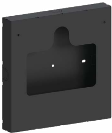
Surface mounting box for easy cabling (ABACUS 2) LIGA-SCE-ABACUS-2