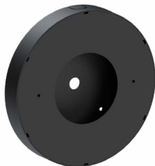
Surface mounting box for easy cabling (SANDY 1) LIGA-SCE-SANDY-1