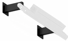
150 mm extend arm mounting LIGA-A30991