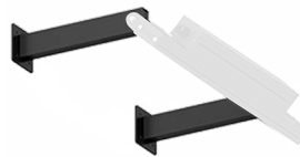
300 mm extend arm mounting LIGA-A31091