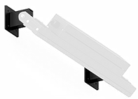
75 mm extend arm mounting LIGA-A30891