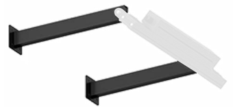
450 mm extend arm mounting LIGA-A31191